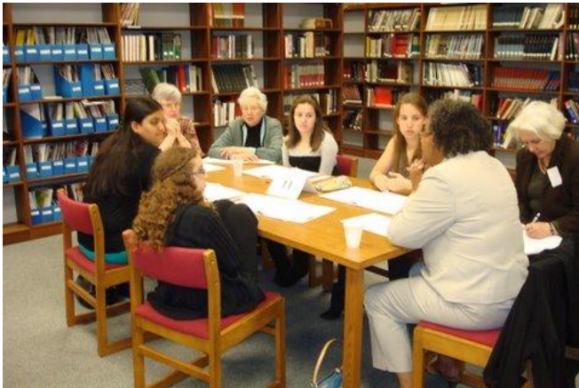
1 - Meeting with officials and facilitators