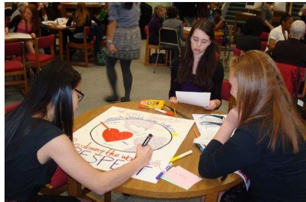
2 - Planning a campaign