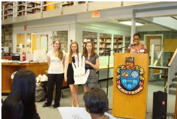
3 -- Vote for me!